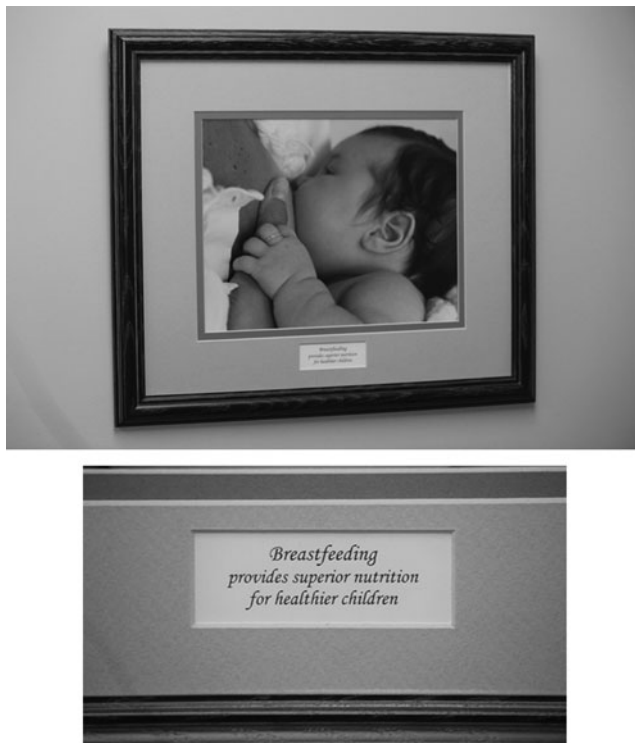
FIG. 1. Breastfeeding-friendly graphic in a family physician's office in the United States.

supply, blocked ducts, engorgement, reflux, normal stool and voiding patterns, maintaining lactation when separated from the infant (for example, during illness, prematurity, or return to work), breastfeeding in public, postpartum depression, maternal medication use, and maternal illness during breastfeeding). (I)